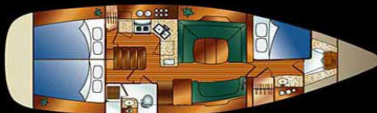
Three Stateroom Version