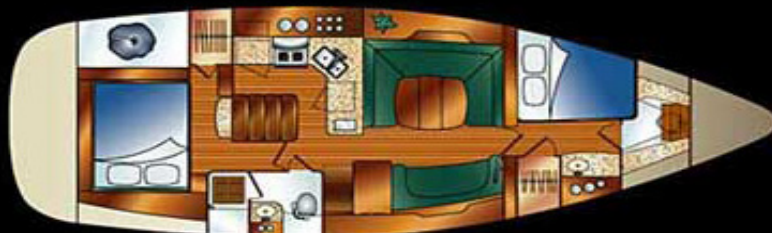
Owner's Stateroom Layout